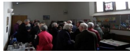
Flavour of our Church life